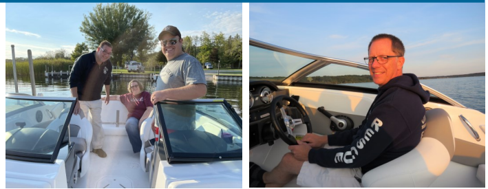
Staff taking the new camp boat out for a test run late last fall

Waterfront improvements. Camp was blessed with the donation of a used Hobie Wave sailboat during COVID-19. Though the boat was in very good shape, it needed a few items repaired and some lines replaced. This is currently being worked on and will be ready for summer, allowing campers to