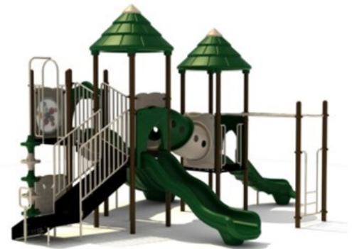
A section of the new playground equipment; not pictured: two regular swing and two infant swing sections