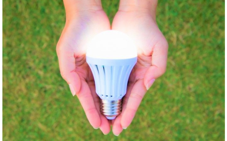
Consumers Energy swapped out 750 incandescent light bulbs at camp with LED bulbs at no cost to Little Eden