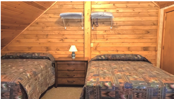
Twin Oaks East and West renovations

Upgrades in cabins. We have upgraded some of the mattresses to queen size in Maplewood, Room 4 U, Wel-Cum Inn East & West and Twin Oaks East & West. The dressers and nightstands in Knot Inn have been replaced, along with several other pieces of furniture in other cabins.